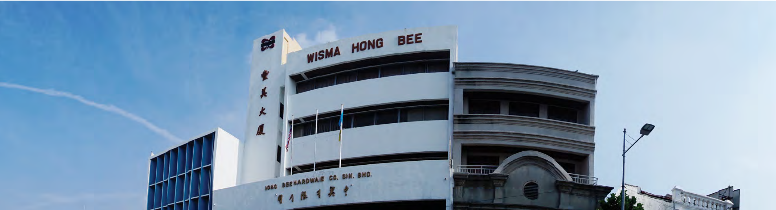
Wisma Hong Bee was built in the early 80's and has been operating as our HQ since then.

In addition to its distribution profile, Hong Bee's investments are diversified within other industries, one of them being property development. Perumahan Menara and its subsidiary, Townside Developments are real estate development companies under the Hong Bee umbrella. It started out as a small real estate developer under the foresight of catering to Penang's booming development during and after the 1980's.