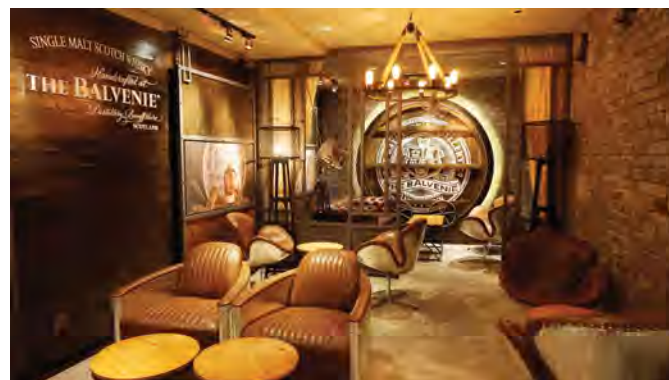
Weld Quay Whisky is located at Ground Floor, 49-H, Pengkalan Weld, 10300 George Town, Penang.