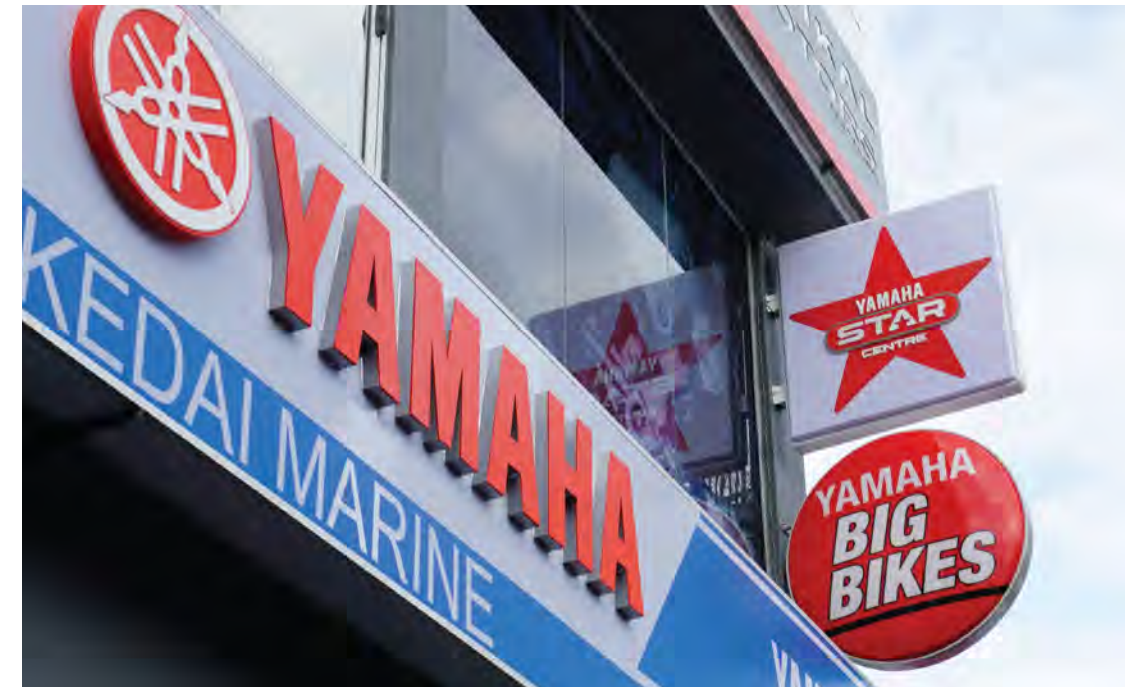
Hong Bee Motors is the first and longest serving Yamaha dealer in Malaysia.