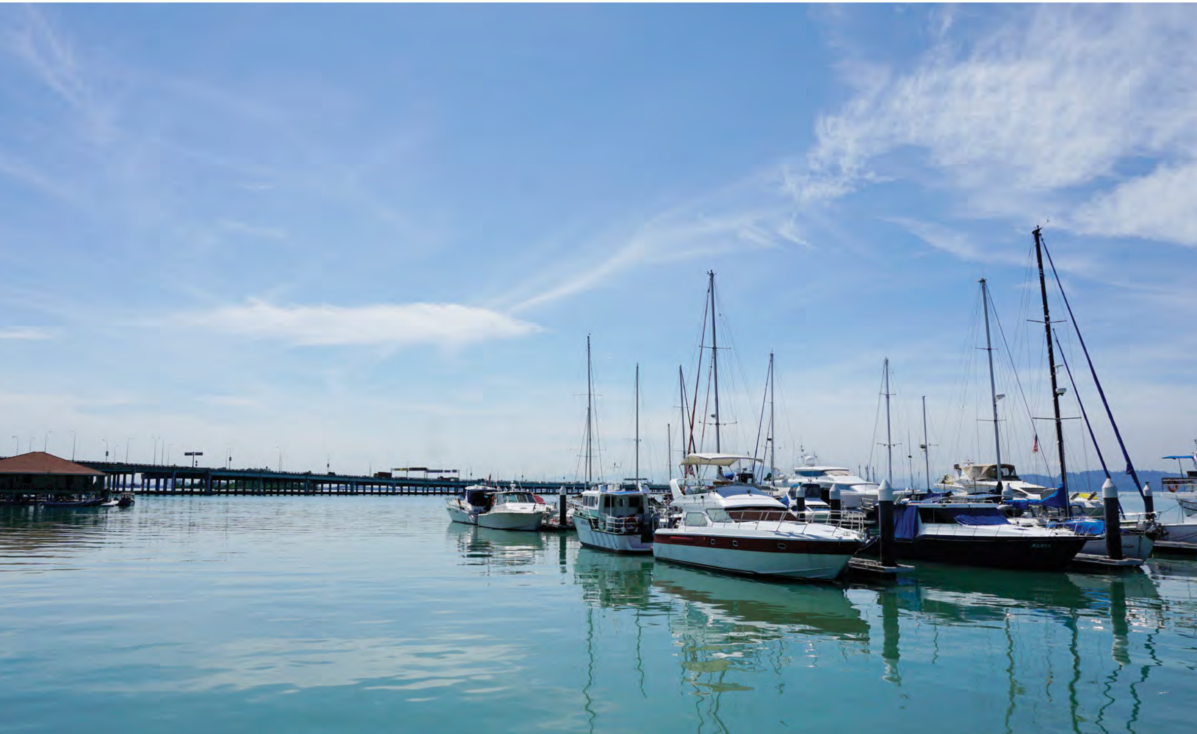
Our carried products are varied and designed to meet every conceivable market's needs, be it agricultural or recreational, transportation or watersports adventures.