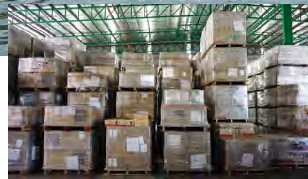
Our biggest store facility has a span of over 90,000 sq. ft.