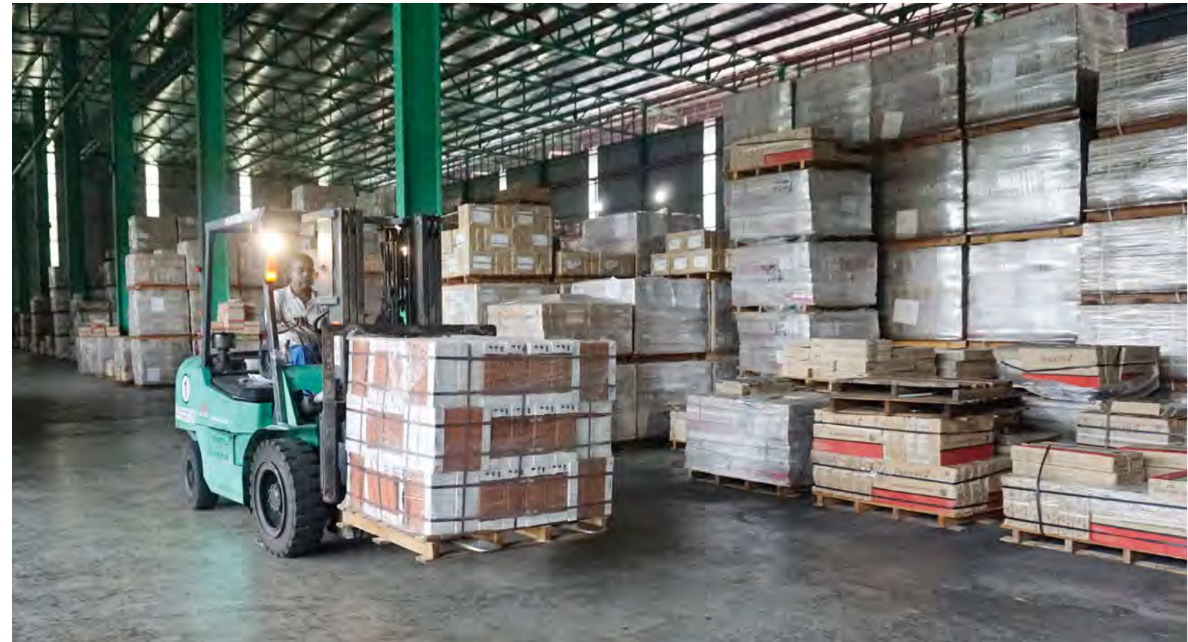
We offer tailor-made logistics solutions for all our customers across Malaysia.

Guided by our company's vision, we aim to be the most efficient link between the principals and the customers by adding value in the distribution chain, through a broad knowledge of the customer needs and prospects of the principals. We enable our clients to reduce headcount, stock and debtor risks. At the same time, we empower our principals to improve service levels to their customers through improved coverage and higher call frequency, which we can offer through our economies of scale.