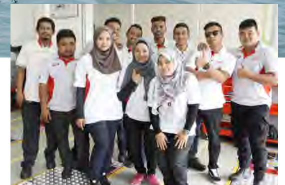
We have a dedicated team of 500 staff all across Malaysia.