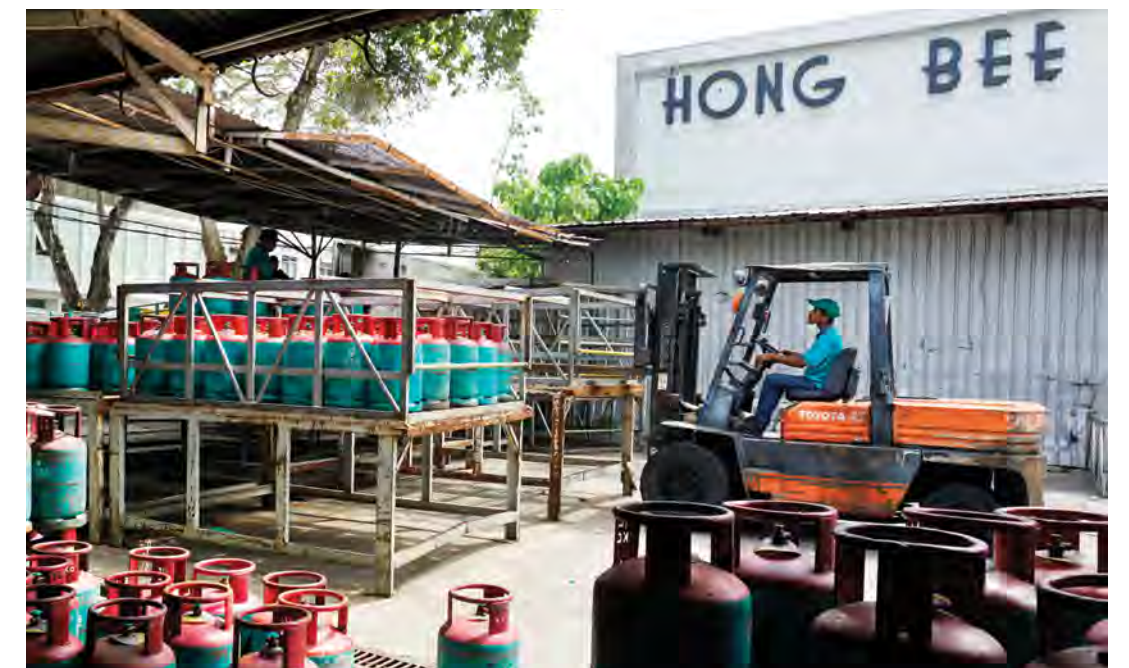
Our store in George Town, Penang is our longest standing warehouse having operated since the 60's.

The kitchen is usually where the magic happens, and that is especially true in our culture. Since 2000, Hong Bee has been providing kitchen households and food outlets in Penang with utility gas. We have been in partnership with Petronas Dagangan Berhad (PDB) – Malaysia's leading retailer and marketer of downstream oil and gas products for over 12 years, and at 40,000 cylinders of Liquid Petroleum Gas (LPG) distributed per month, we are one of PDB's premier dealers in George Town, Penang.