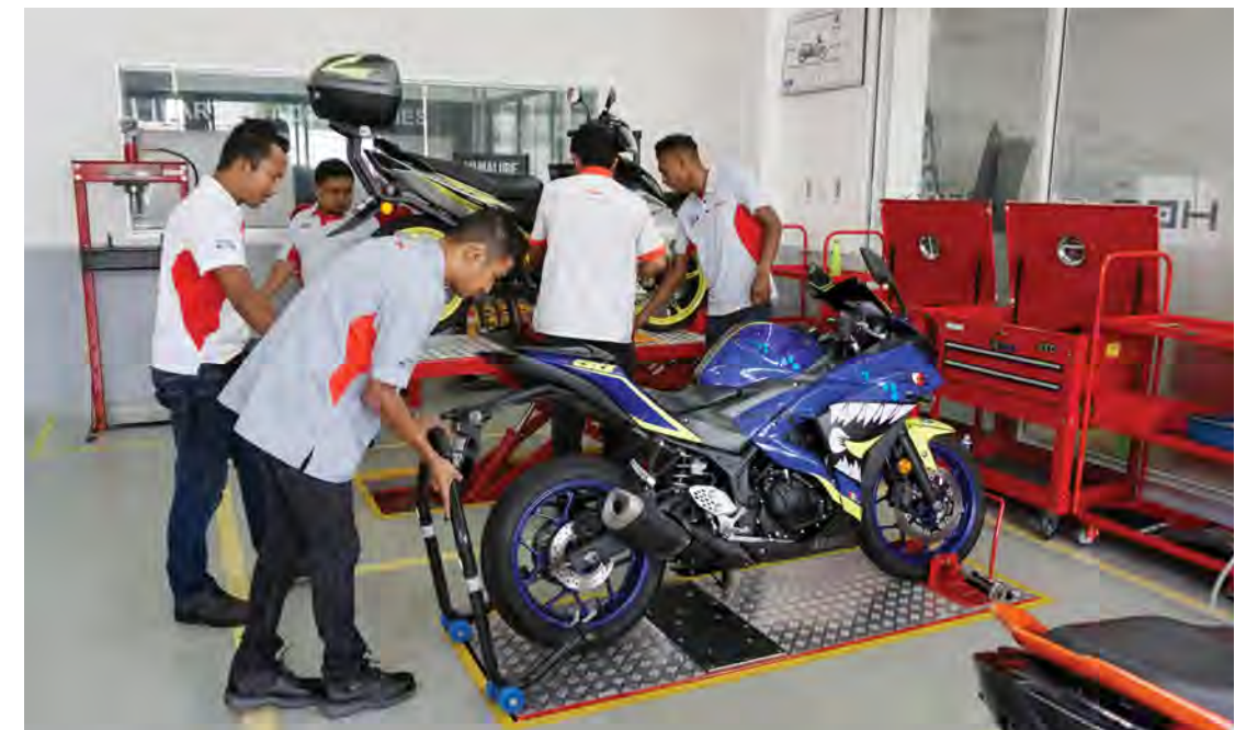
We provide the best after-sales service for all Yamaha customers.