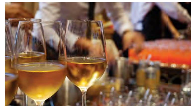
We also offer bar services for all occasions. For more info, you can go to our Contact Us page to get in touch.