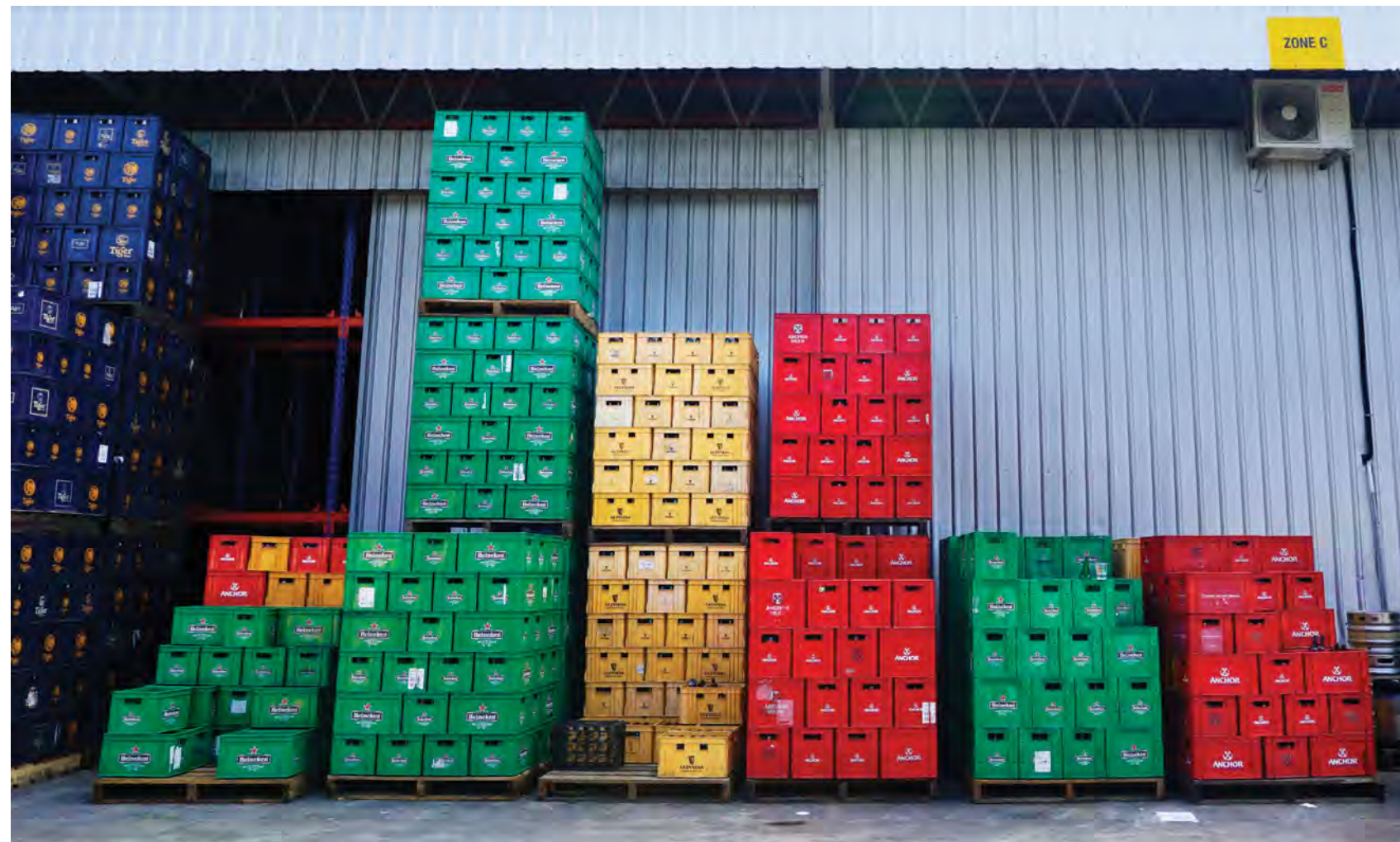
We sell over 50,000 hectolitres of Heineken Marketing Malaysia's products annually.

Sake is to Japan as wine is to France with an equally long history to match. As the footprint of Japanese culture spread over the world, so did the appreciation for sake. Here at Hong Bee, our approach is deeply rooted in convictions such as demystifying the world of sake and showcasing the distinctiveness of categories, predominantly that of the Junmai (pure rice) variety. Alongside our range of sake, we also hold a variety of Japanese fruit liquors, namely Umeshu and Yuzushu.