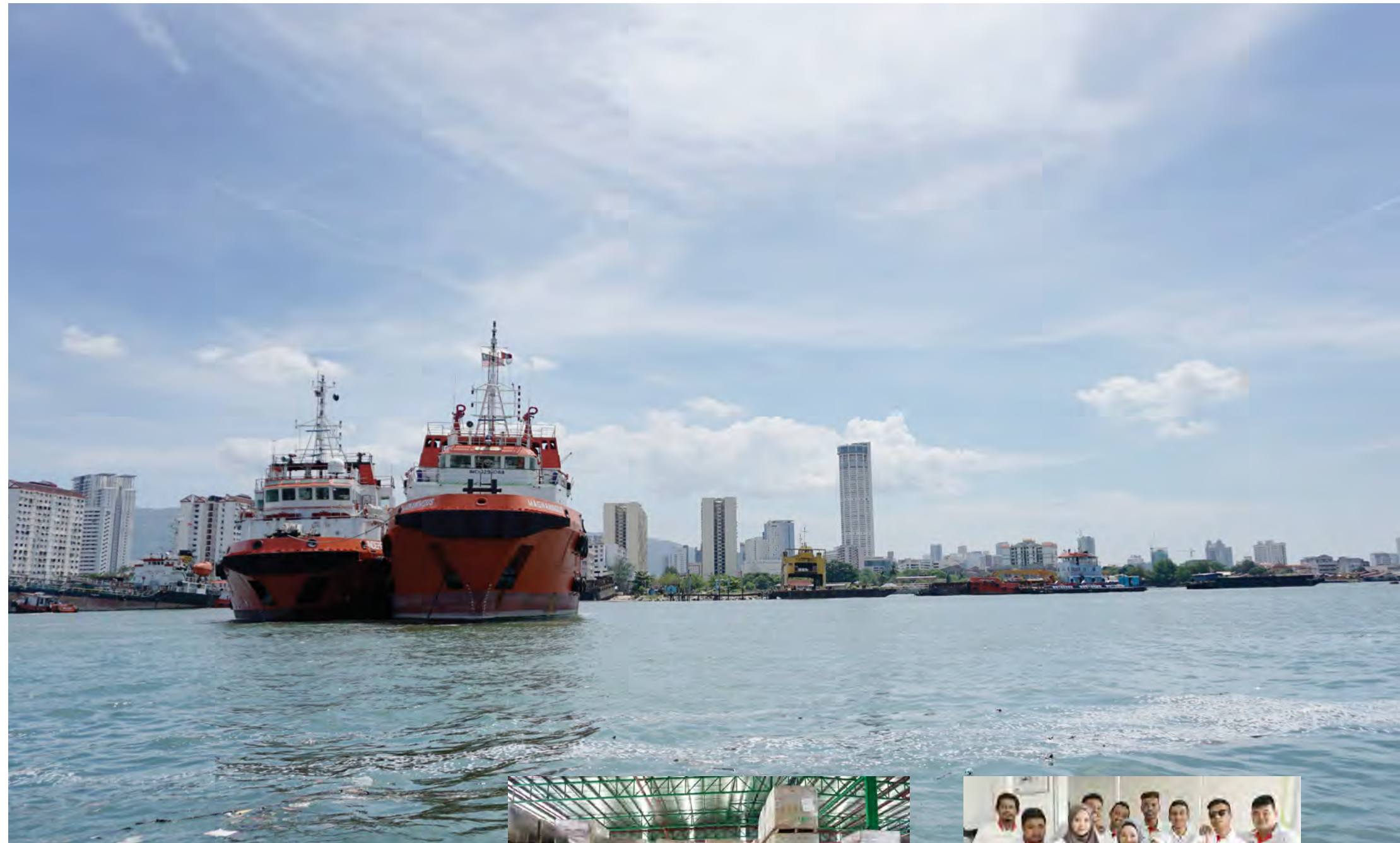
We are proud to grow alongside Penang in our 70 years of operation.

We provide for customers big and small and we are present, every day in the lives of millions of consumers across Malaysia. When you think of Hong Bee, you get vast industry and product knowledge that comes from a culture that values experience, supports growth and employs proficiency with every customer interaction.