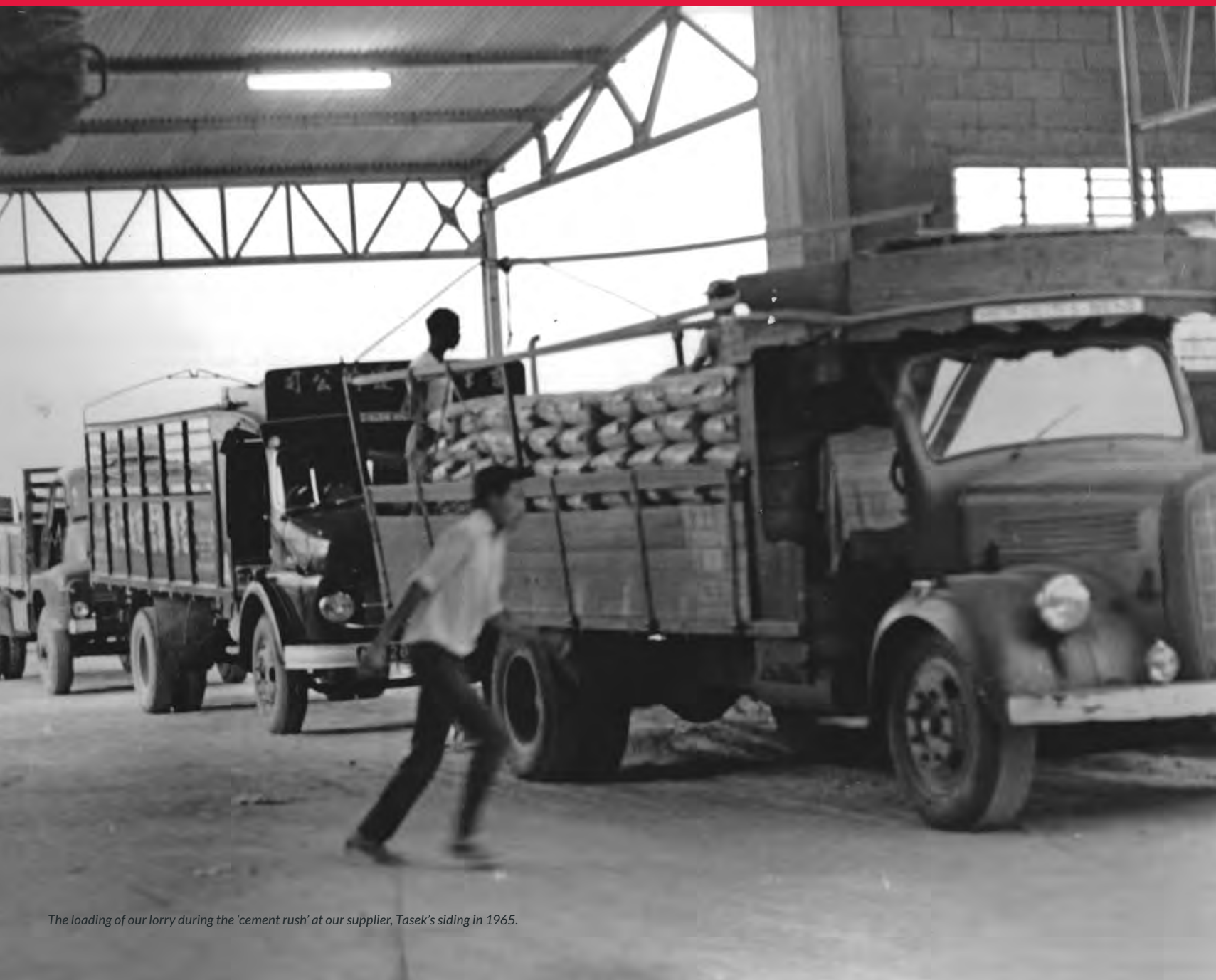
The loading of our lorry during the 'cement rush' at our supplier, Tasek's siding in 1965.